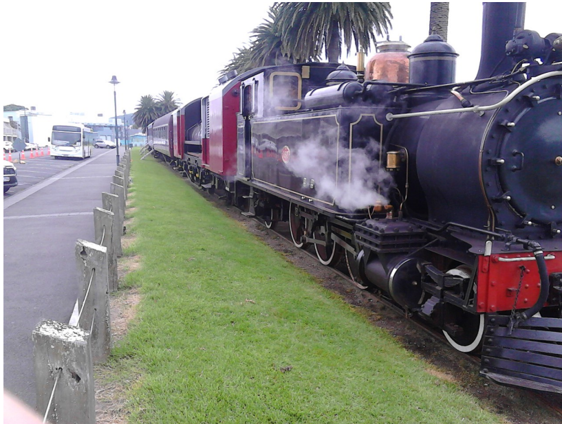
One of the buses used to carry cruise ship passengers from the port to the waiting train. Normally 3 or 4 buses are used.

Due to the forecast arrival of another “atmospheric river” (no, not Cyclone Gabrielle), the Regatta (which had been in Gisborne on 28 th January) asked on 30 th January if there would be any chance of having another train charter on 1 st February, if it could not get to the Bay of Islands on 31 st January due to the weather. Unfortunately due to the short notice and for various other reasons, it was decided that the extra charter would not be possible. In the end, the Regatta after a short visit to the Bay of Islands, did come back to Gisborne for 1 st February, but the weather was not great for a train trip that day anyway.