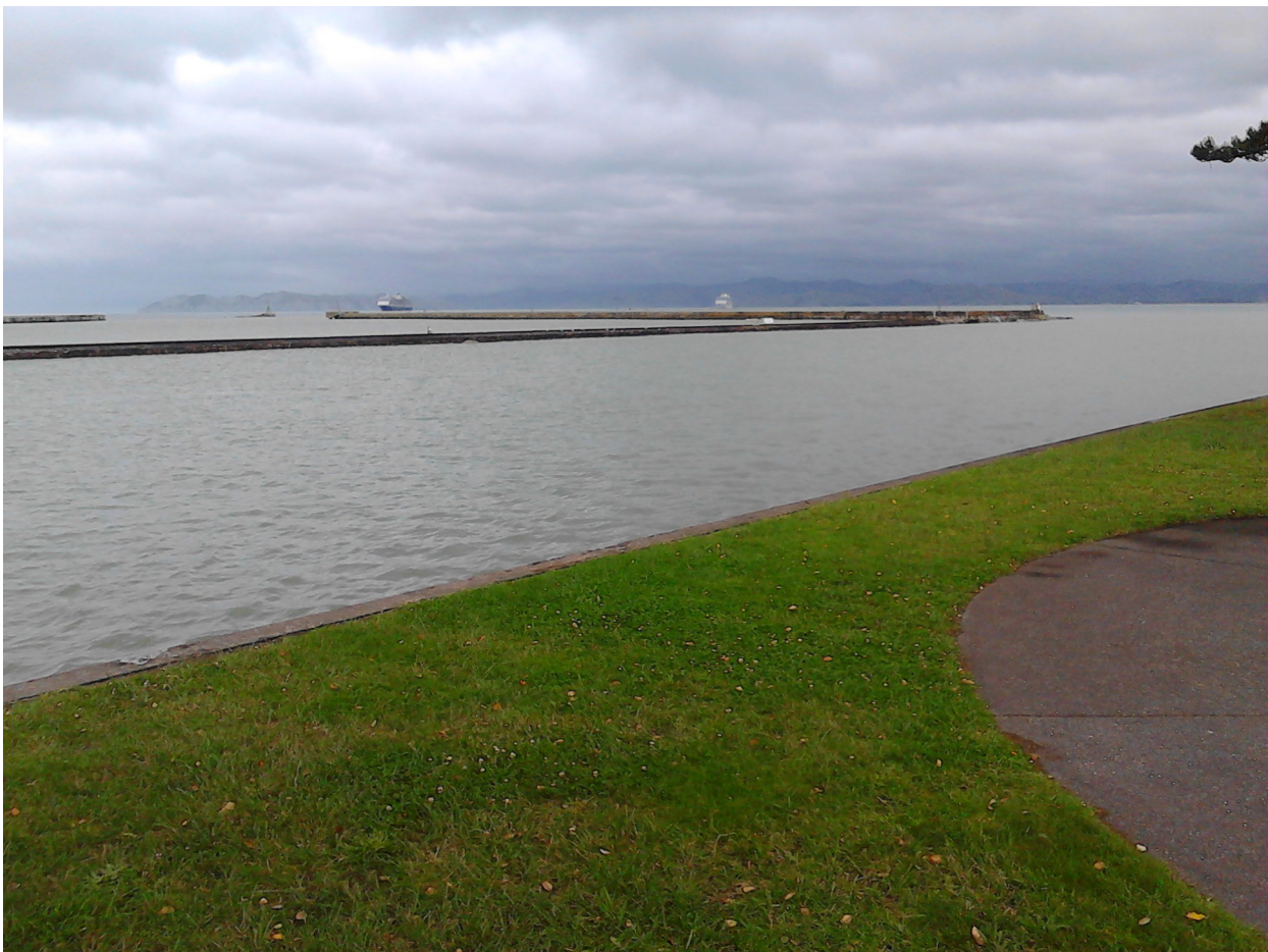
The Noordam (left) and the Regatta (right). (I must get a better camera!)

We had 2 cruise ship excursions on 28 th January – the Regatta in the morning (120 passengers) and the Noordam in the afternoon (145 passengers). A 6am start to get the train ready, after some of the maintenance volunteers had warmed up the locomotive boiler the day before. The rain held off for the morning trip, but arrived just in time for the afternoon arrival at Muriwai. The Muriwai Primary School Kapa Haka group boarded the train to get out of the rain (only a handful of passengers got off) and sang three songs in each carriage, which was appreciated by the passengers. The Noordam had just come from Auckland, so the passengers knew all about the weather conditions and disastrous flooding that had happened in the North Island courtesy of Cyclone Hale. (At that stage, Cyclone Gabrielle did not exist, so we did not know what was going to happen on 13 th February when that cyclone arrived!)